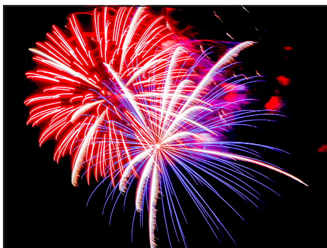
Fireworks will be blasting off at Meeks Park, Woody Gap School and other venues around the region for America's 247th birthday on Tuesday, July 4.

Artists of all ages can participate in the Sandcastle Contest taking place at noon on the beach. At 1 p.m., the field games open at Vogel's ballfield, and people camping can show their American pride by decorating for the Cottage and Campsite Decorating See Independence Day, Page 2A