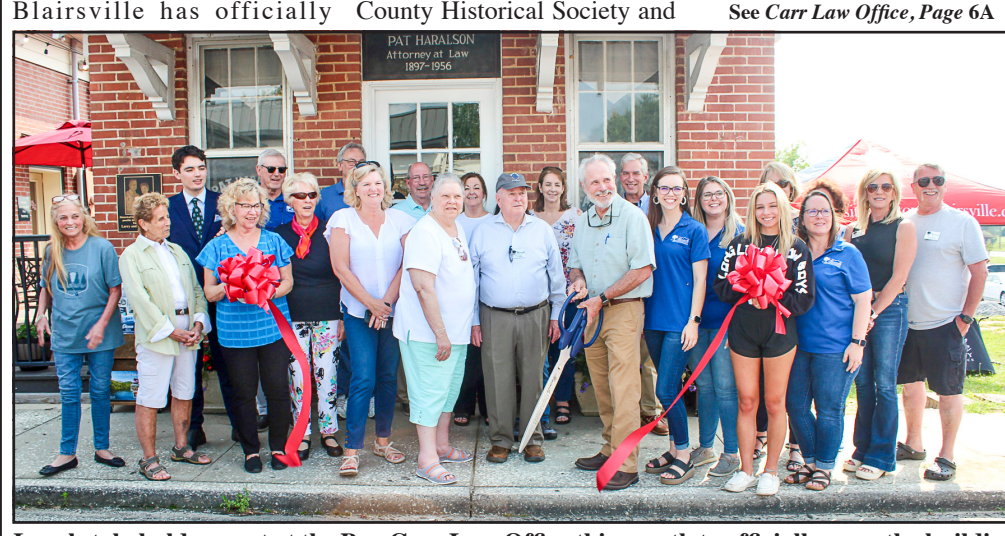
Local stakeholders met at the Ben Carr Law Office this month to officially open the building as a new welcome center and museum.

light renovations, the building will serve a different purpose Law Office in Downtown fundraising between the Union now by doubling as a museum See Carr Law Office, Page 6A