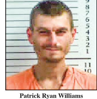
sumed innocent until proven